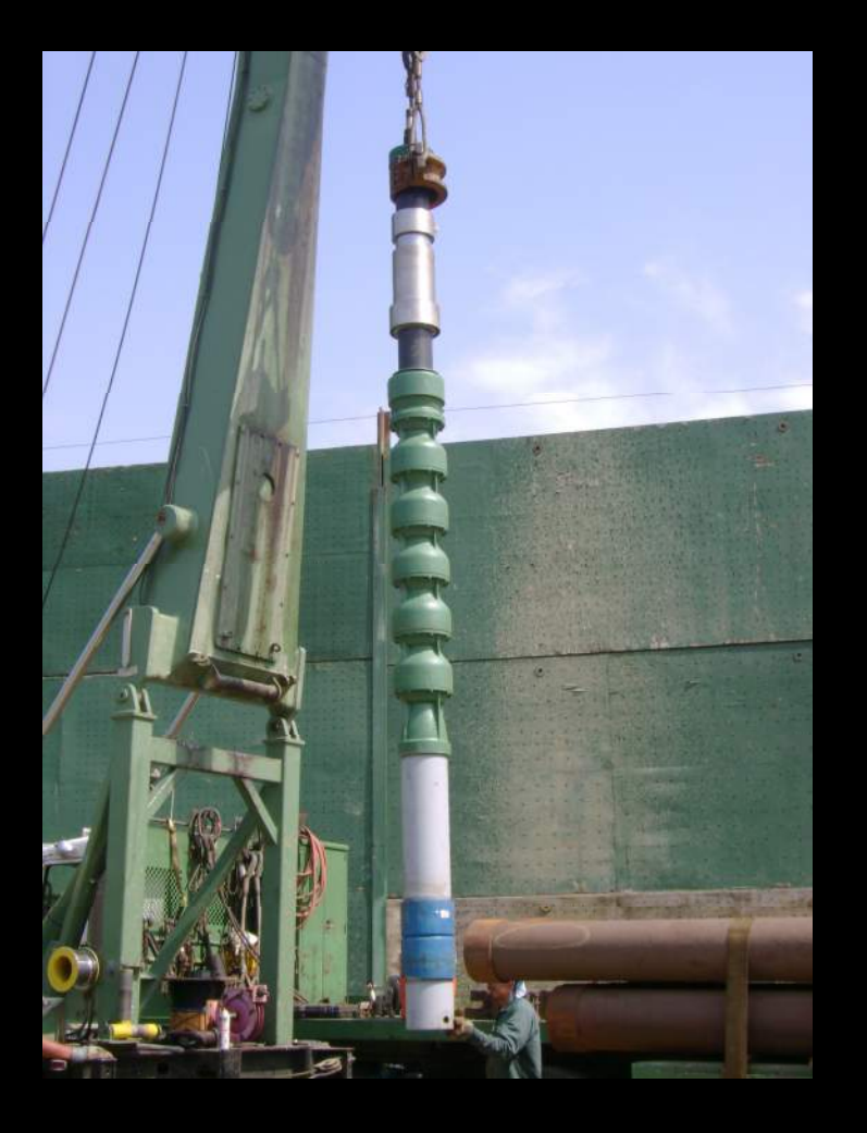
Installation of down hole flow control valve