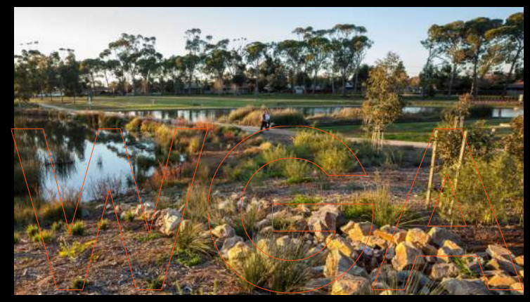
Unity Park Wetland - City of Salisbury