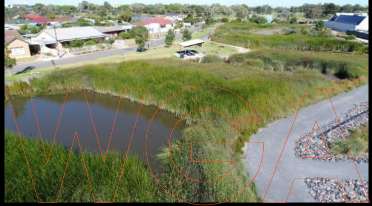
Cooke Reserve – Waterproofing the West City of Charles Sturt